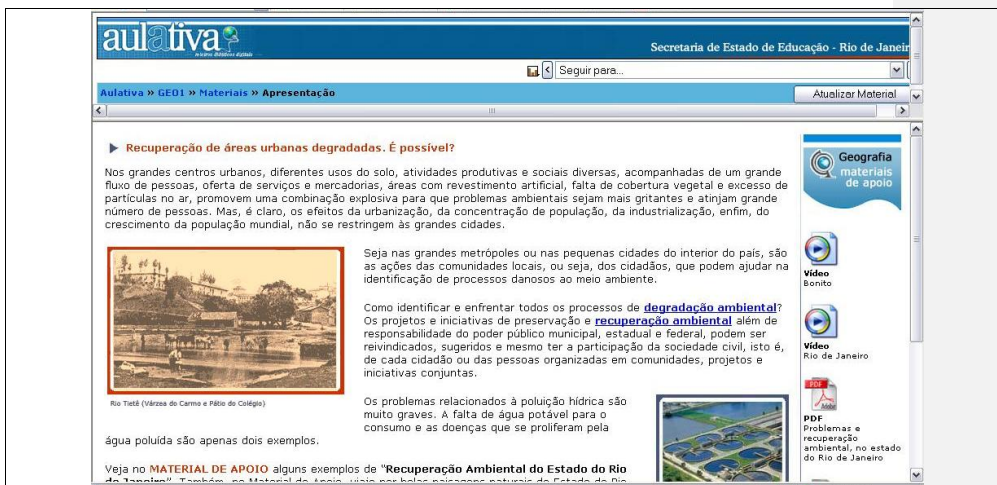
Figure 3.2 – Main screen a workplan.